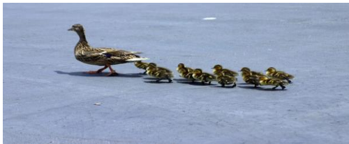
Imprinting of ducks