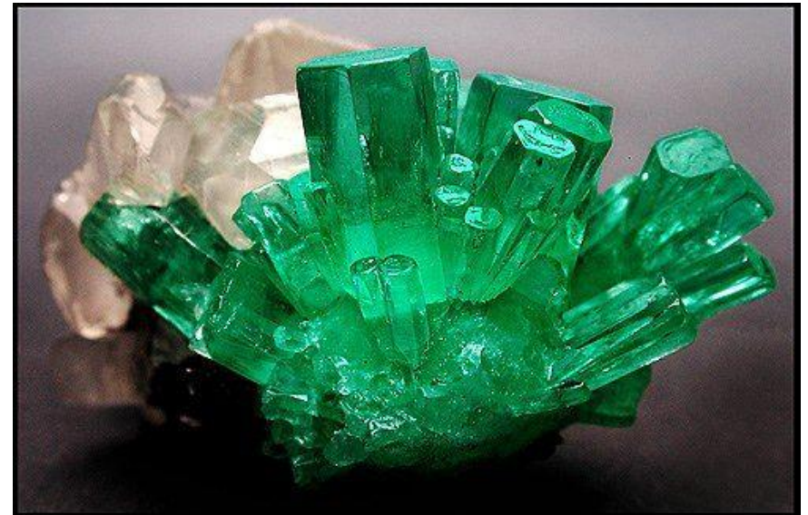
Emerald: the fourth stone of the New Jerusalem